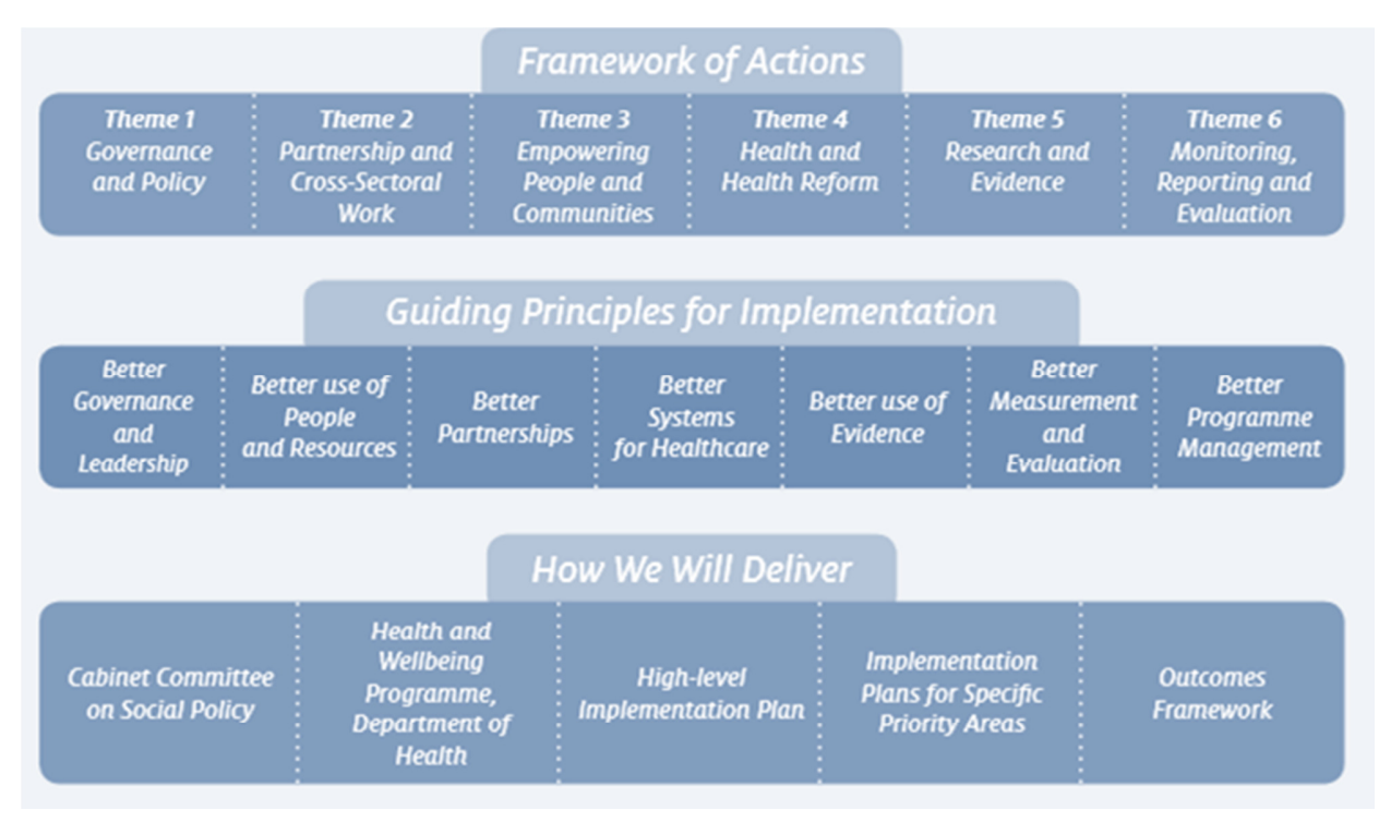
Figure 3.1: Framework for improving health and wellbeing (DoH, 2013)

The reforms set out in both Future Health (DoH, 2012) and Healthy Ireland (DoH, 2013) aim to return the focus to health rather than disease and to ameliorate the burden of chronic illness in our population. In this context, the recently established Health and Wellbeing Division is focusing its work in the following areas: